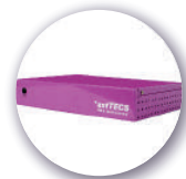
SBC (Session border controller)