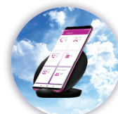
Cloud & Mobile Solution