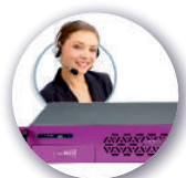
Call Center Dialer